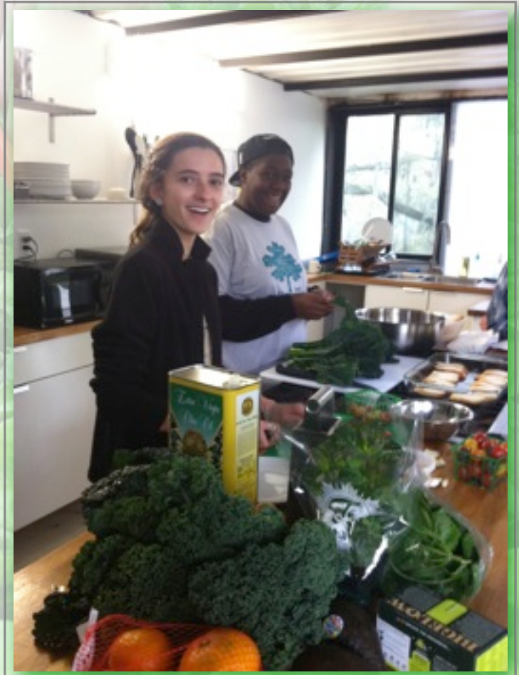
Youth from Urban Roots in Austin, Texas in the Grow Dat Teaching Kitchen, prepping an amazing meal from our fields and the farmer's market for the final Cook-Off with our fall Interns

The fun and engaging exchange culminated in a Cook-Off where youth from both organizations lead a test cooking demonstration for one another and then provided feedback on kitchen skills, teaching techniques, the inclusion of health and food system information and overall presentation. This spring Grow Dat staff and youth will continue the learning process by visiting Urban Roots in Austin, Texas. Research will continue with a visit to see the robust youth-led Urban Nutrition Initiative (UNI) in Philadelphia sometime in 2014.